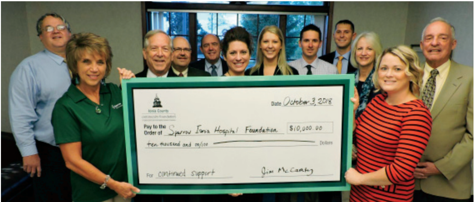
Ionia County Community Foundation Board members proudly present a $10,000 check as yet another pledge payment toward their $50,000 commitment in support of the new Sparrow Ionia Hospital. Several members of the hospital board and staff are pictured accepting the check. In appreciation, hospital representatives thanked ICCF “for their dedication to the health of our community.”